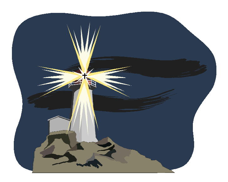
Lighthouse Bible Church